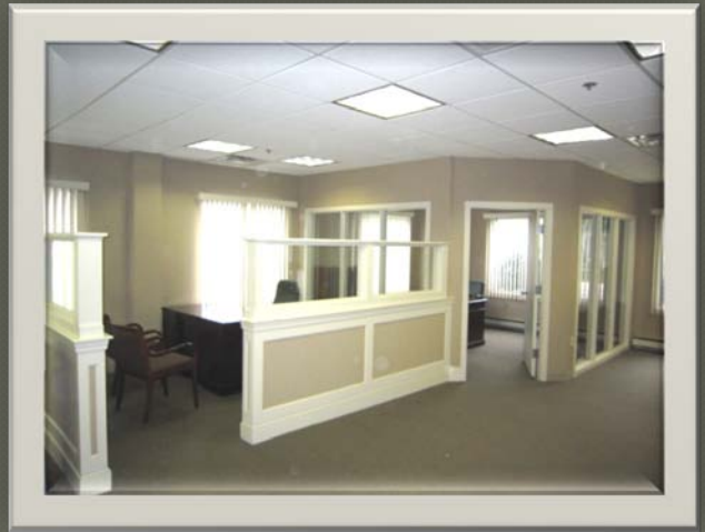
BRAINTREE PROFESSIONAL CENTER